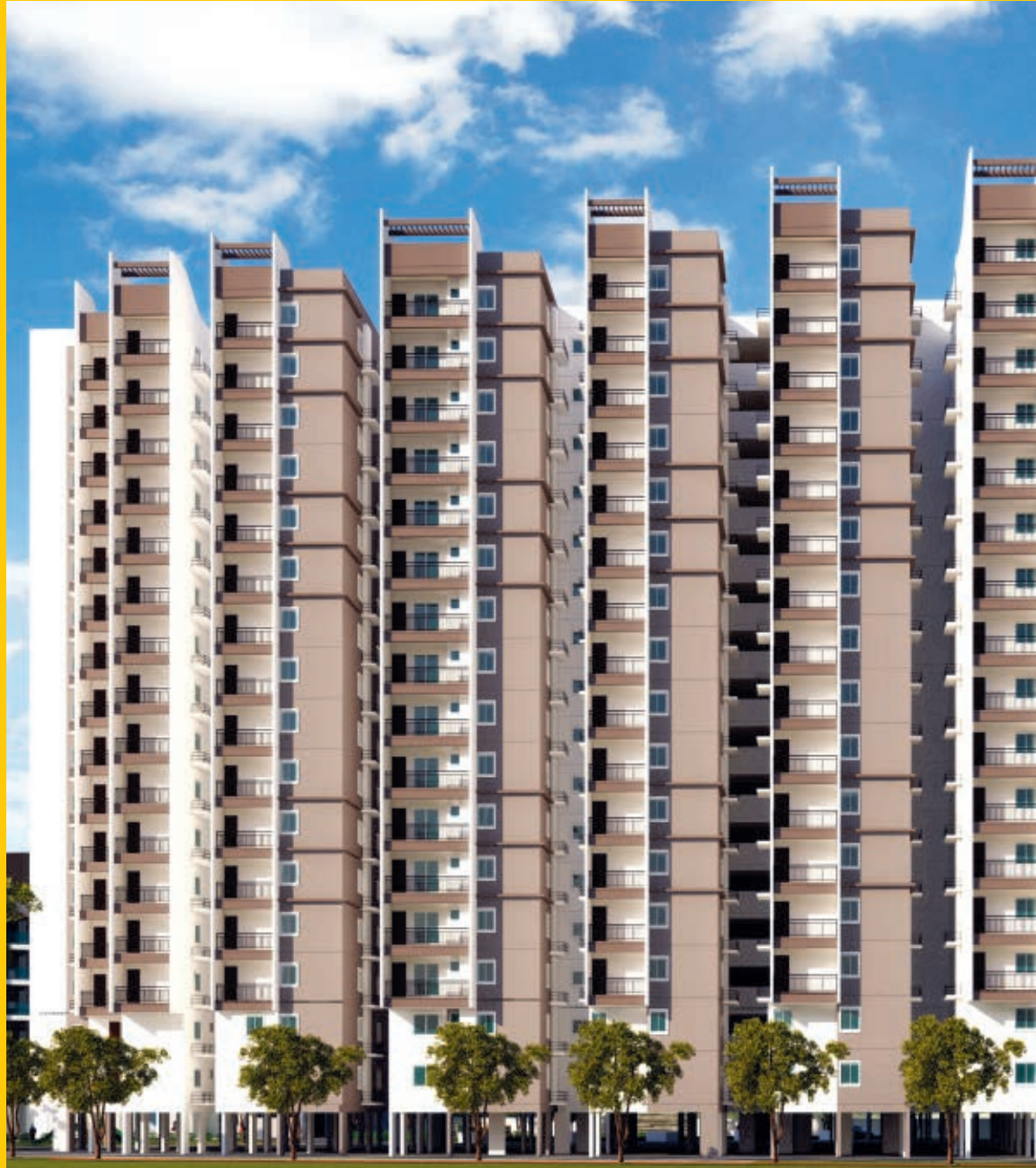
An Artistic view of Block - A