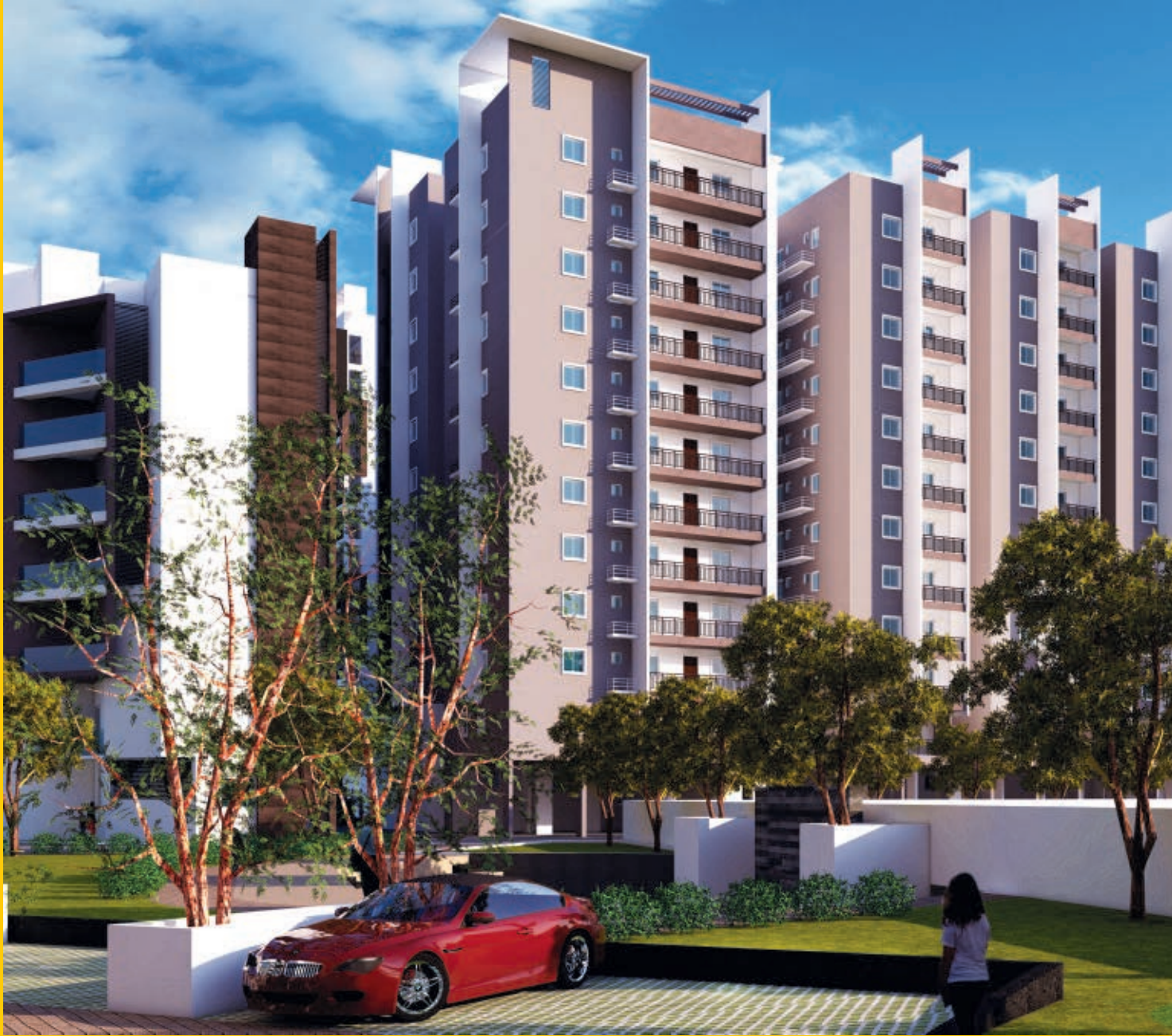
An Artistic view of Block - B