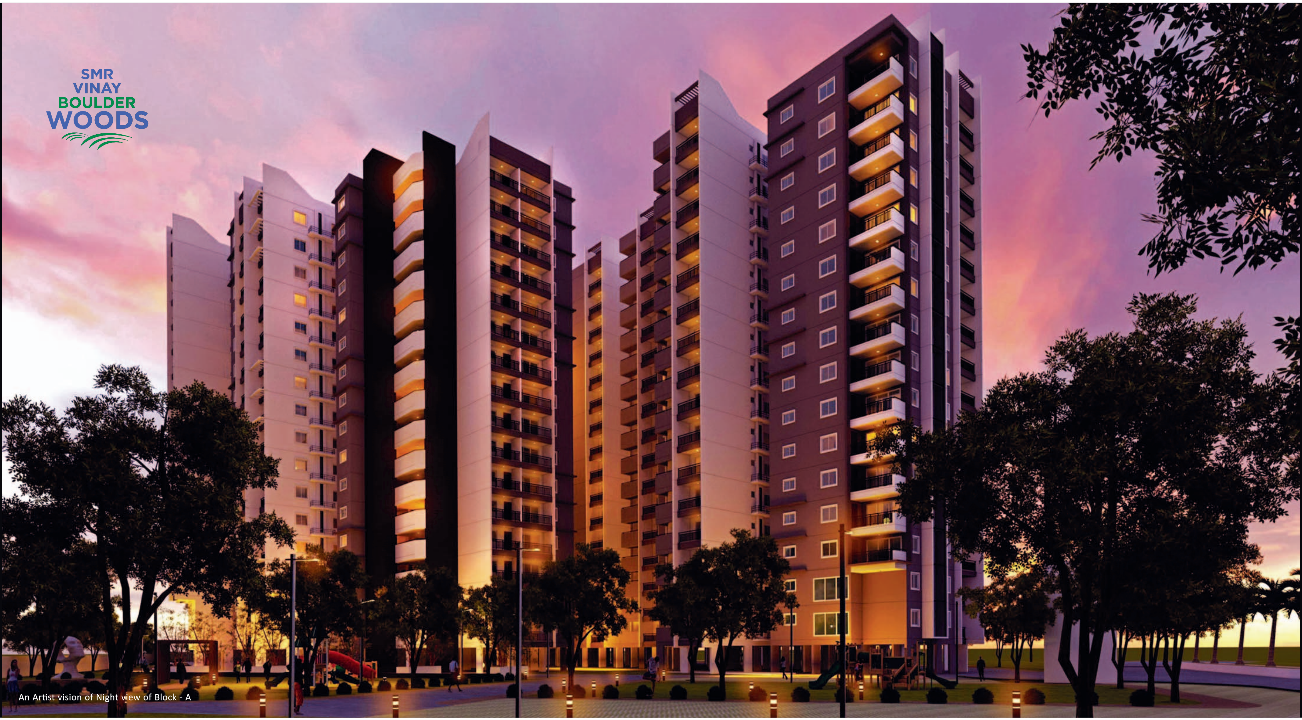
An Artist vision of Night view of Block - A