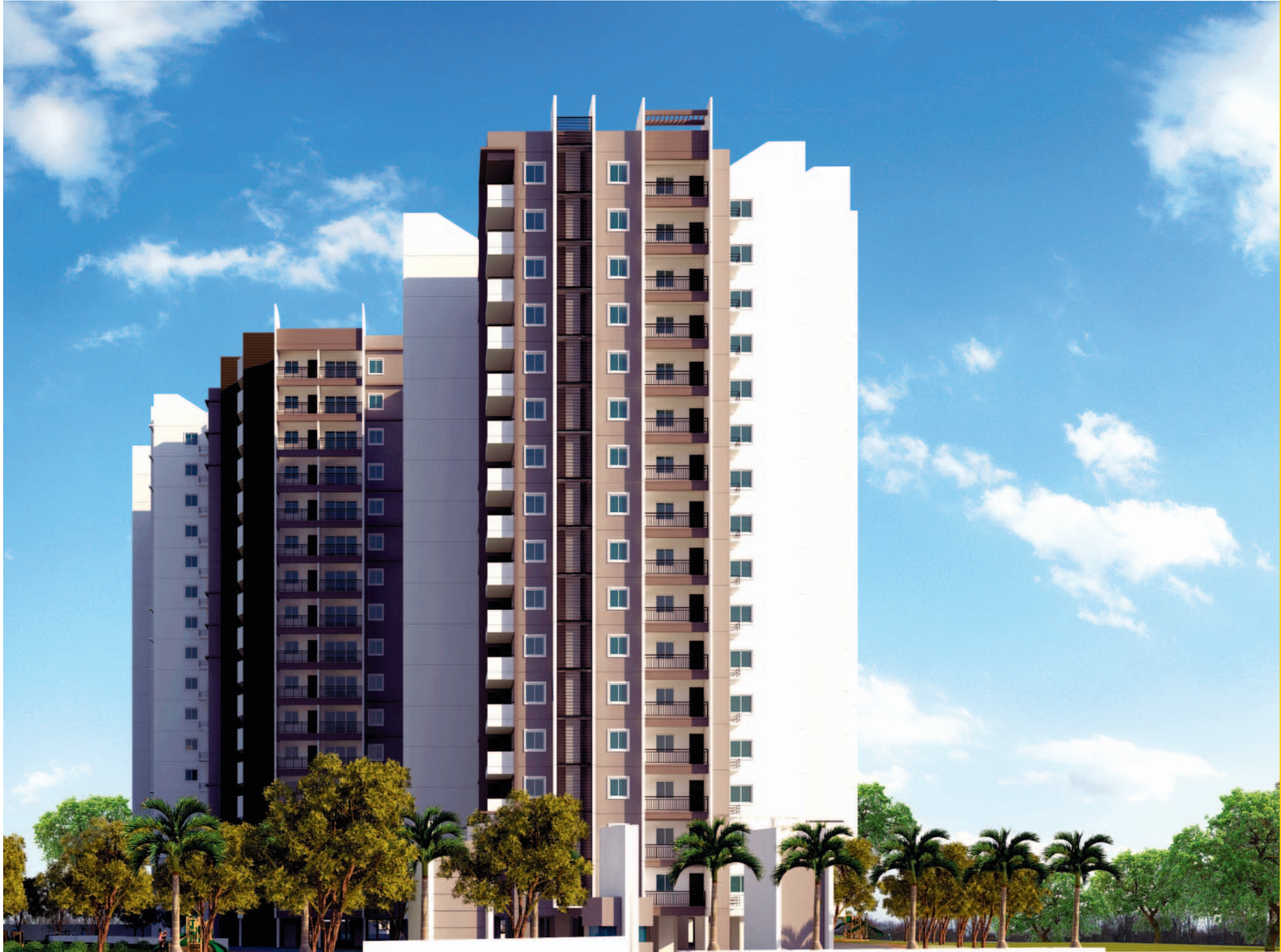
An Artistic view of Block - A

What makes Boulder Woods the preferred Home for the successful, the seeker, the active, the retired, the practical, the artist, the settler, the wanderer a compelling choice?