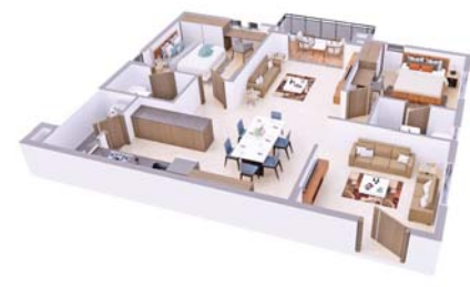
West-facing | 1285 Sft | 2 BHK