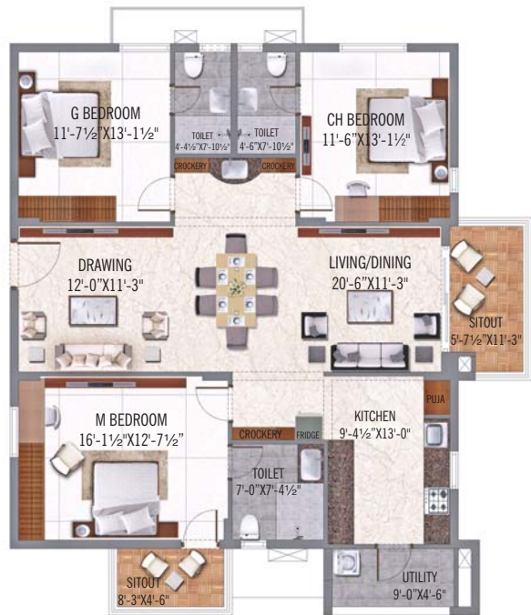
West-facing 1885 Sft | 3 BHK