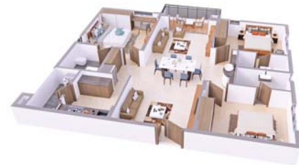
East-facing | 1585 Sft | 3 BHK