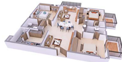
East-facing | 1885 Sft | 3 BHK