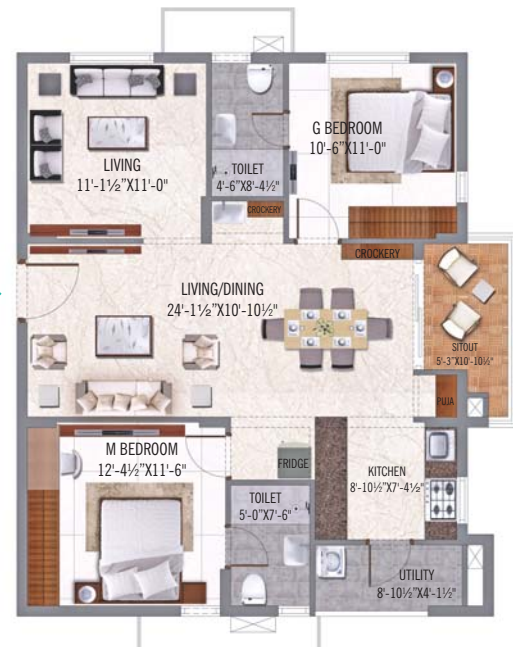
West-facing Corner 1285 Sft | 2 BHK