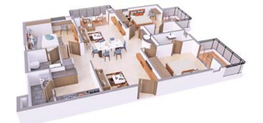
East-facing | 1700 Sft | 3 BHK