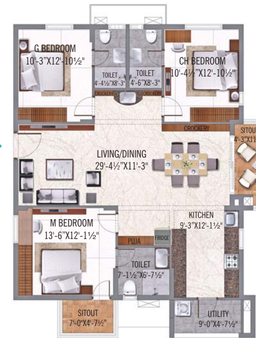
West-facing 1700 Sft | 3 BHK