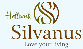
240 Premium Flats @ Neknampur