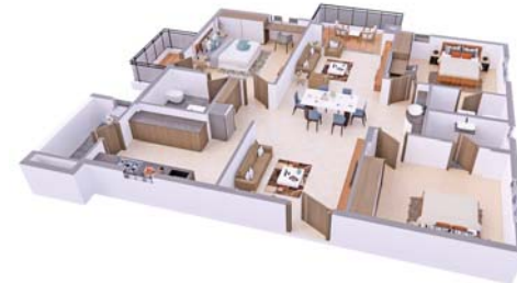
East-facing Corner | 1885 Sft | 3 BHK