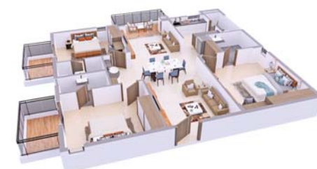
West-facing | 1885 Sft | 3 BHK