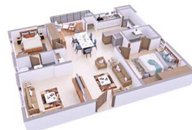
West-facing Corner | 1285 Sft | 2 BHK