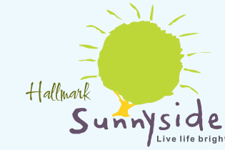
G+9 Floors Luxury Apartments in 5.7 acres @ Manchirevula