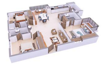
West-facing Corner | 1700 Sft | 3 BHK