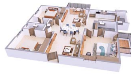
West-facing Corner | 1885 Sft | 3 BHK