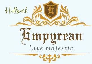
245 Premium Flats @ Puppalaguda