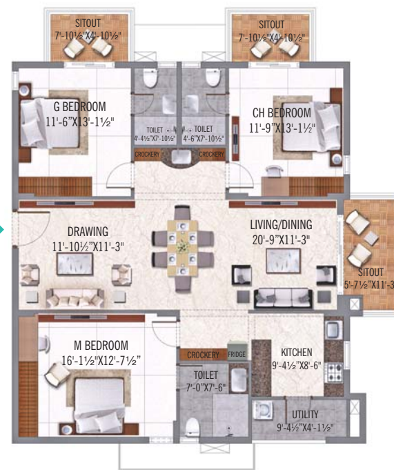
West-facing Corner 1885 Sft | 3 BHK