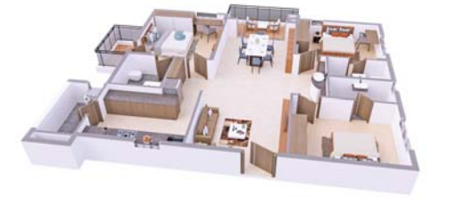
East-facing Corner | 1700 Sft | 3 BHK