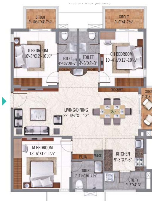
West-facing Corner 1700 Sft | 3 BHK