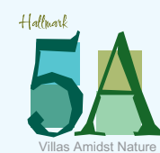
Ultra-modern Boutique Villas in 5.37 acres @ Pati, off Kollur