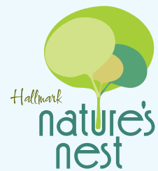
Proposed Lavish Gated Villa Residential Project in 47 acres @ Pati close to Kollur exit