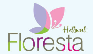
Proposed Ultra-luxury Gated Villa Project in 16 acres @ Pati close to Kollur exit