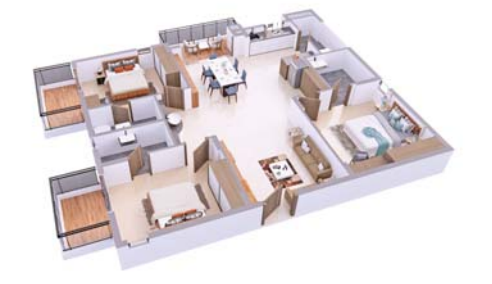
West-facing | 1700 Sft | 3 BHK