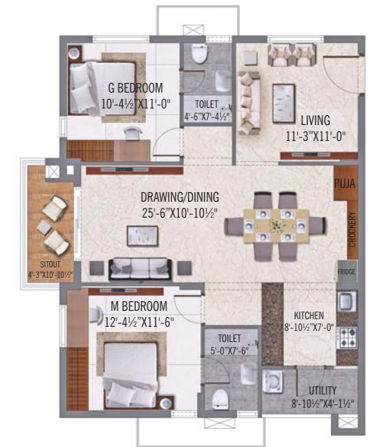
East-facing 1285 Sft | 2 BHK

New-age educational institutions, infotainment centres and malls close by